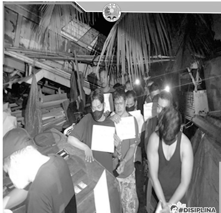
f/CityGovtBacoor www.bacoor.gov.ph f/PIOBacoor

Ang mga naarestong suspects ay dinala sa Bacoor City Police Station habang ang nakumpiskang item ay dinulog sa Cavite Provincial Crime Laboratory Office.