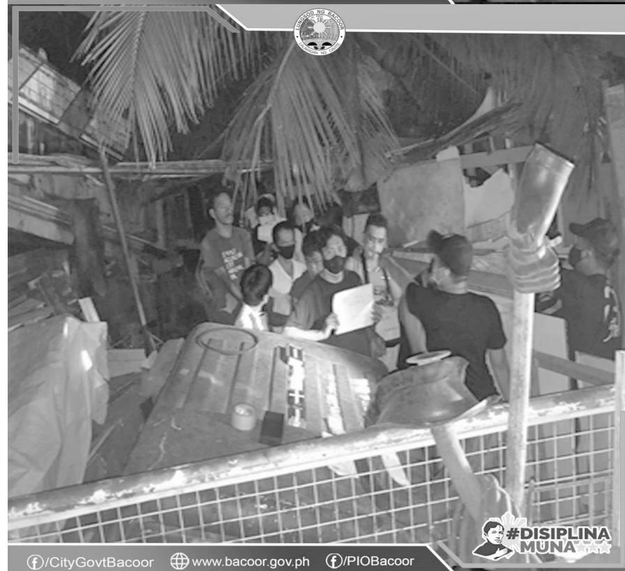
f/CityGovtBacoor www.bacoor.gov.ph f/PIOBacoor